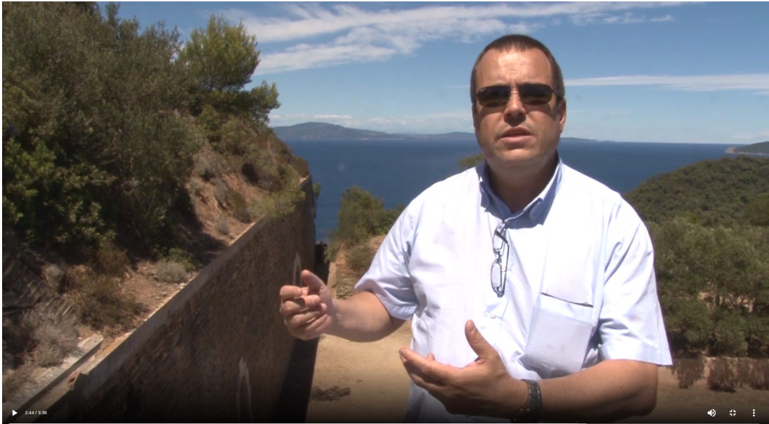
Mission on the field - July 2014 - Toulon Port-Cros

http://sabiody.lis-lab.fr/media/Univ_Toulon_CNRS_BigDataSABIOD_GLOTIN_JASON_PNPC_Chiro3D.mp4