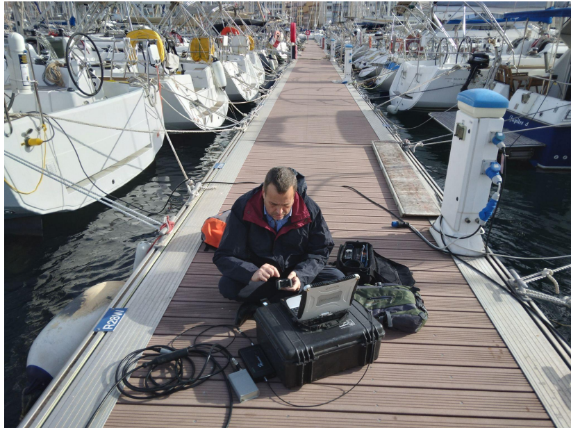
Calibration during Bioacoustics Workshop - March 2023 - Toulon