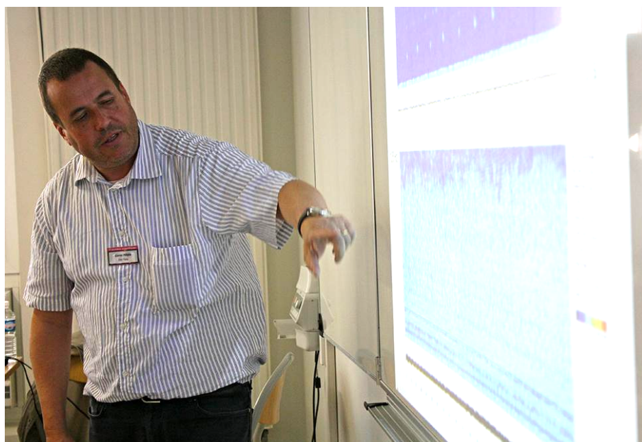
ERMITES Summer School - september 2014 - Toulon