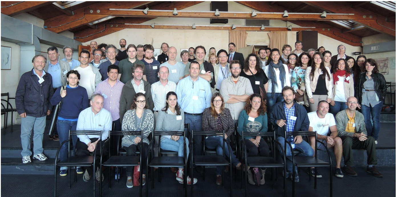
ERICHE 2013, Bioacoustics and Neutrinos, organized by Gianni, Sicilia 2013

http://sabiody.lis-lab.fr/media/Univ_Toulon_CNRS_BigDataSABIOD_GLOTIN_JASON_PNPC_Chiro3D.mp4