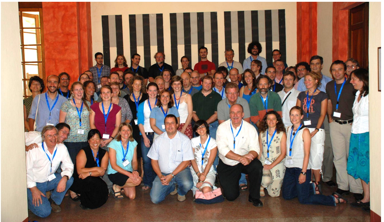
DCLDE Workshop - 2009, organized by Gianni http://www-9.unipv.it/cibra/DCLProceedings2009.html